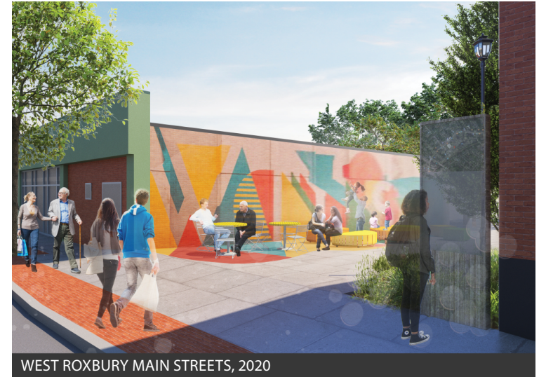
WEST ROXBURY MAIN STREETS, 2020