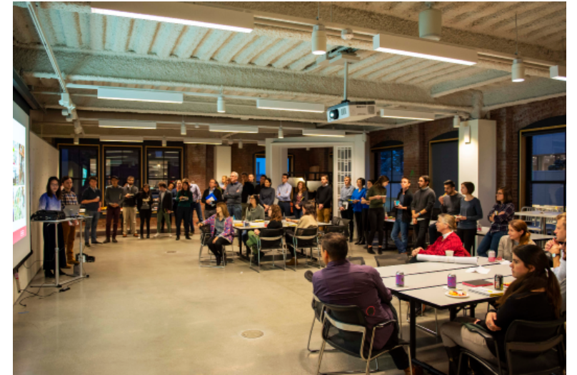
Final Presentation, 2019