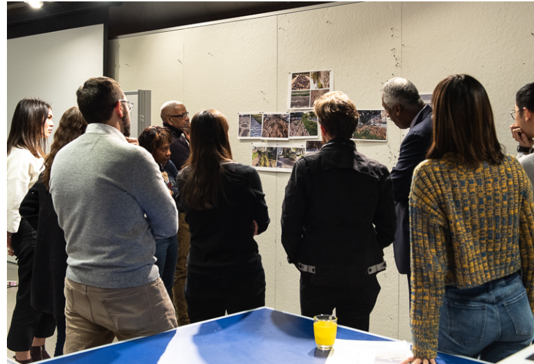
The Greater Grove Hall Main Streets team meets with stakeholders and discusses their site on Blue Hill Avenue

After the Day of Service design charette, teams compile their work into a final deliverable and presentation. In late January, the deliverables are presented to the Community Partners at a Final Presentation Event.