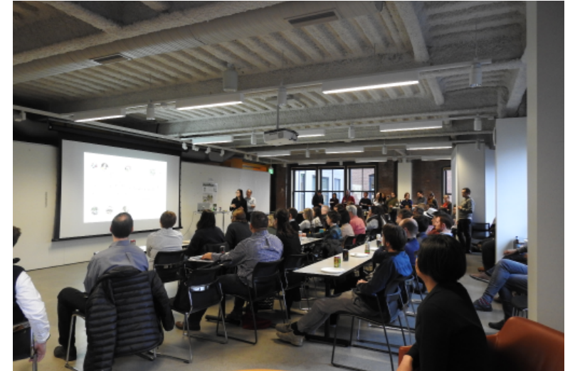
Final Presentation, 2020