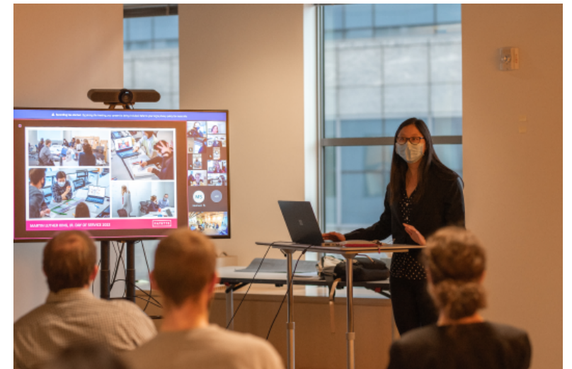
Final Presentation, 2022