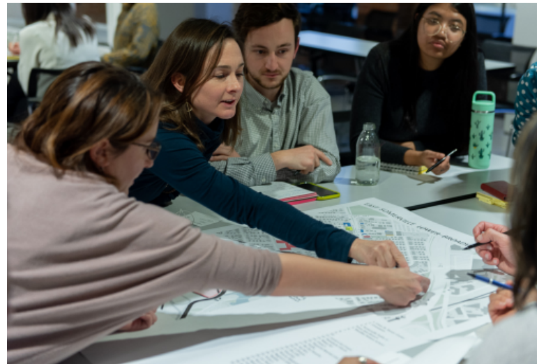
The East Somerville Main Streets team has their second planning meeting with stakeholders.