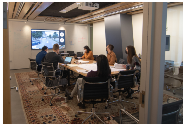
The NAMAZing Initiative Team meets virtually with stakeholders during the Day of Service Design Charette.