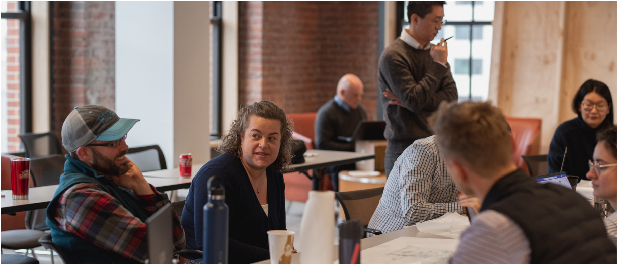
Community partner participation and review is key to the success of the project.

After the Day of Service design charrette, PAYETTE teams compile their work into a final deliverable booklet and presentation. In late January or early February, the deliverables are presented to the community partners at a celebration event.