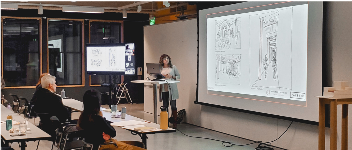
Everyone joins together for the final presentations at PAYETTE's office.