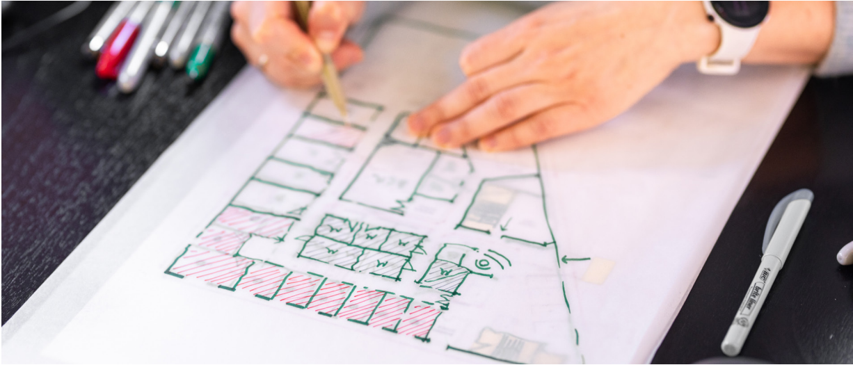
Teams start brainstorming with sketches and diagrams for idea conception.