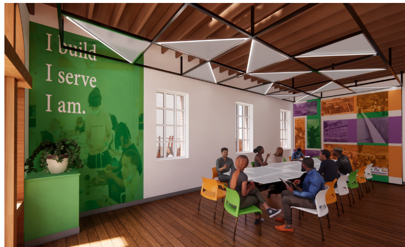
YOUTHBUILD BOSTON, 2023