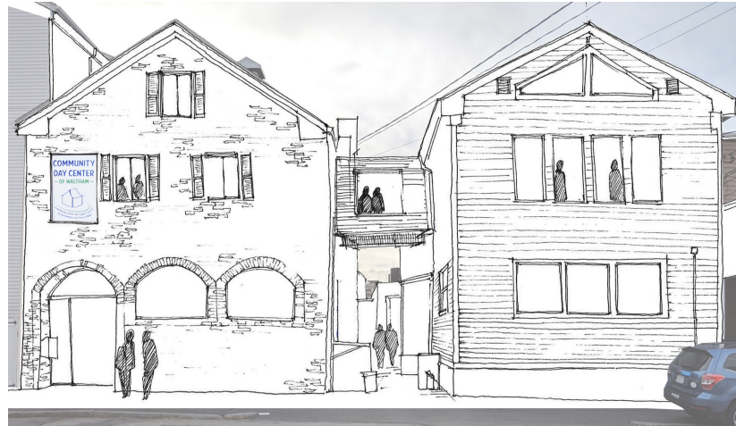
COMMUNITY DAY CENTER OF WALTHAM, 2019