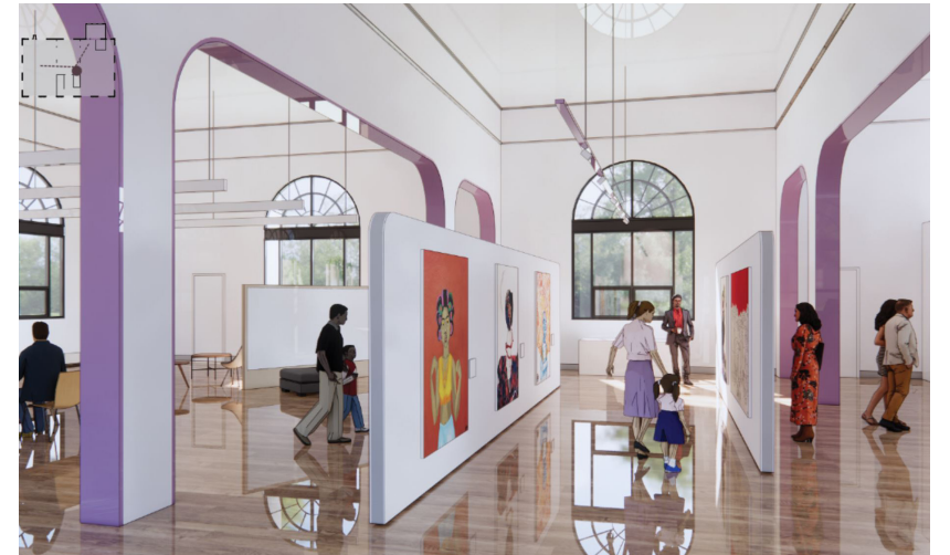
ELEVATED THOUGHT, 2022