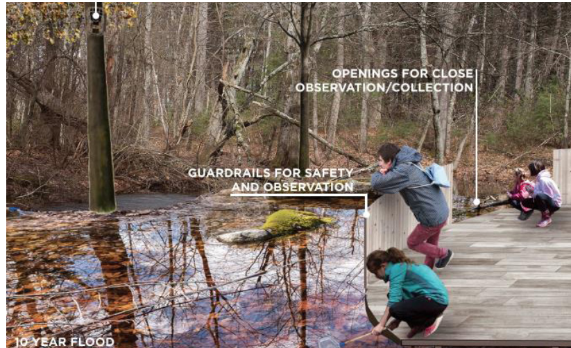
10-YEAR FLOOD MABA AT MA AUDUBON, 2021