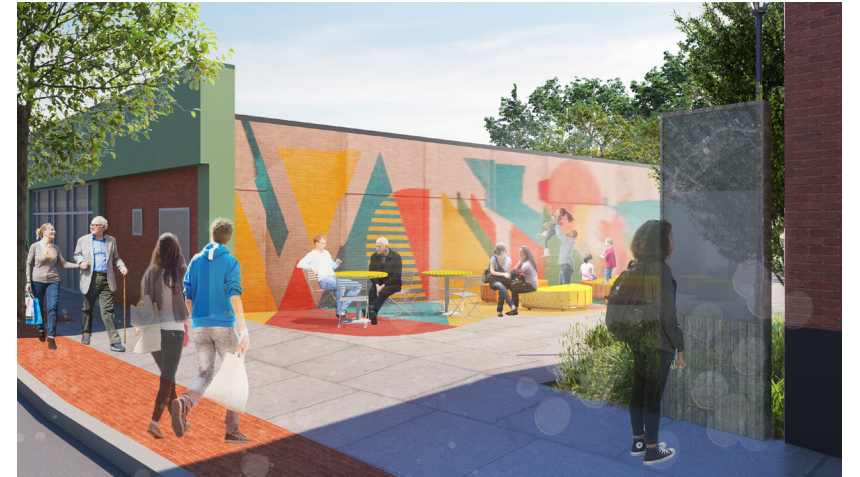
WEST ROXBURY MAIN STREETS, 2020