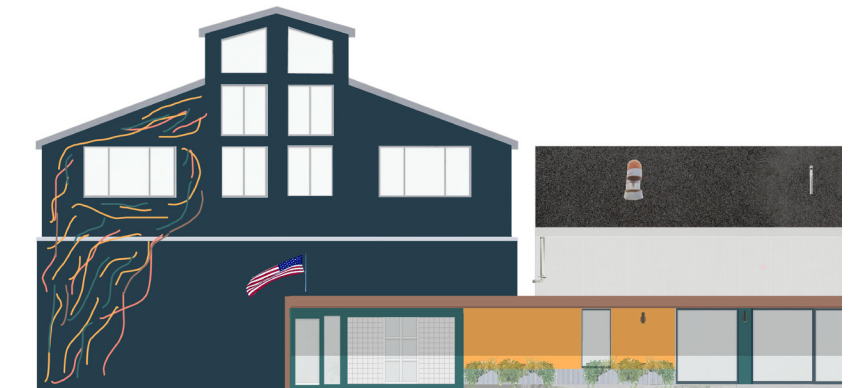
EAST BOSTON NEIGHBORHOOD HEALTH CENTER, 2024